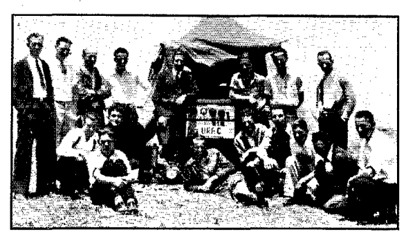
THE UNITED RADIO AMATEUR'S CLUB WITH PORTABLE W6DIS OF WILMINGTON, CALIF.

W4NC reports that eleven of the Winston-Salem Club turned out. They used a 500-watt a.c.