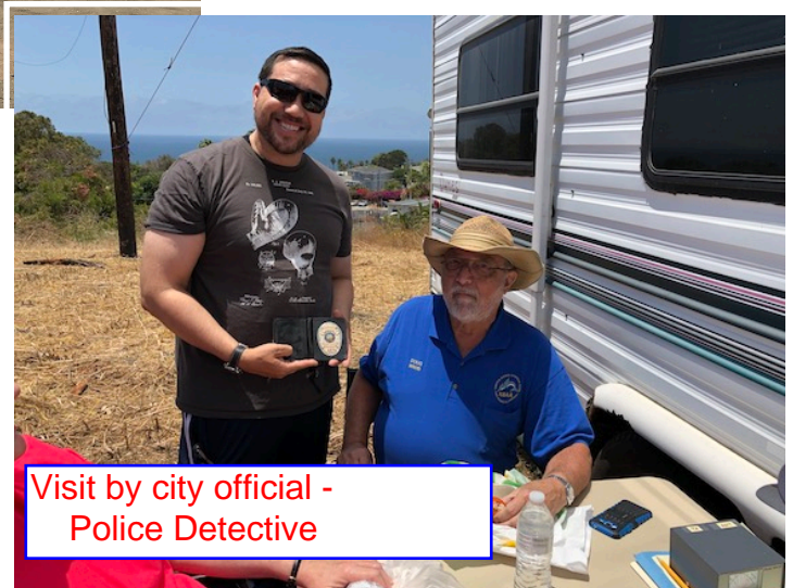
Visit by city official - Police Detective