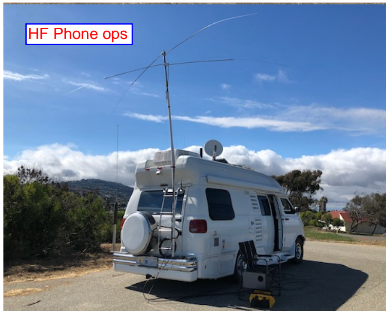
HF Phone ops