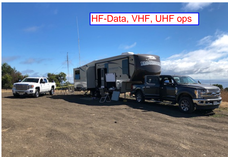
HF-Data, VHF, UHF ops