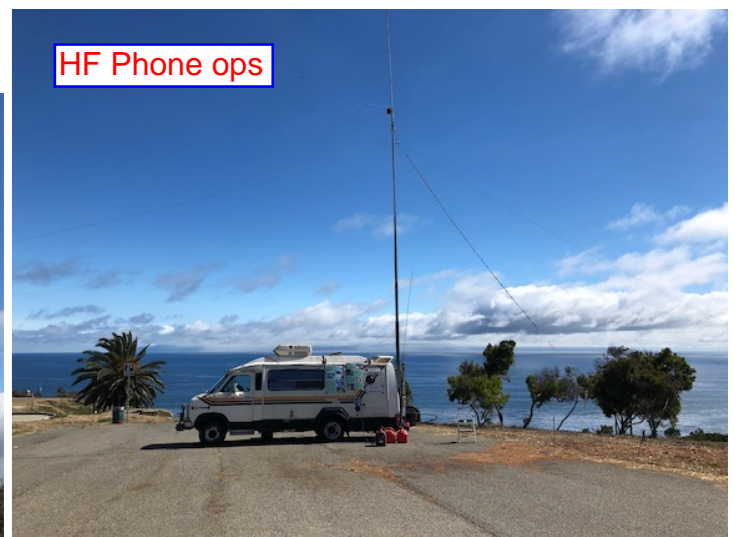
HF Phone ops