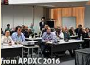
from APDXC 2016