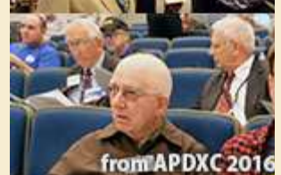
from APDXC 2016